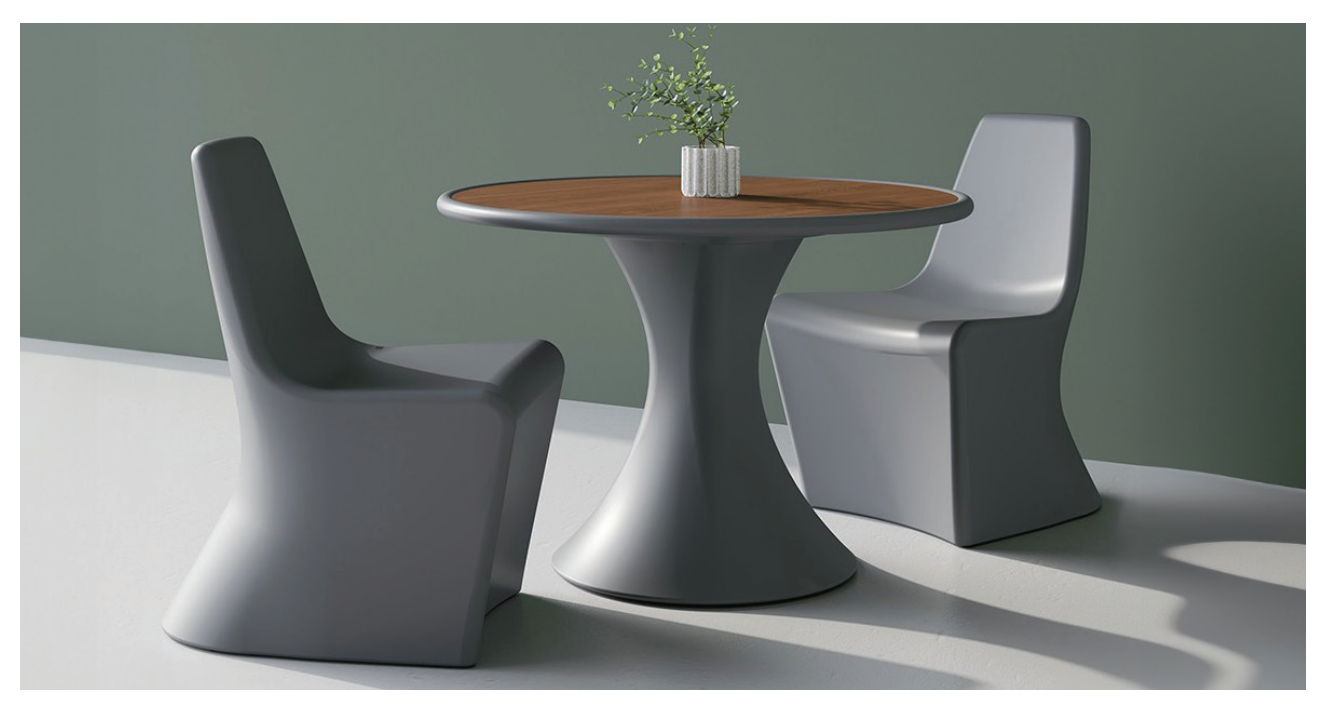
*Shown in Iron Gate with accompanying Roku Kimi Day Chairs.

Explore the Roku® Oyster dining table, featuring a hard round top for elegance and durability. Designed with extreme specifications, ideal for high-security settings and diverse environments.