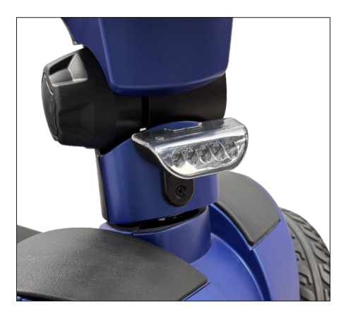
Front and rear LED lighting