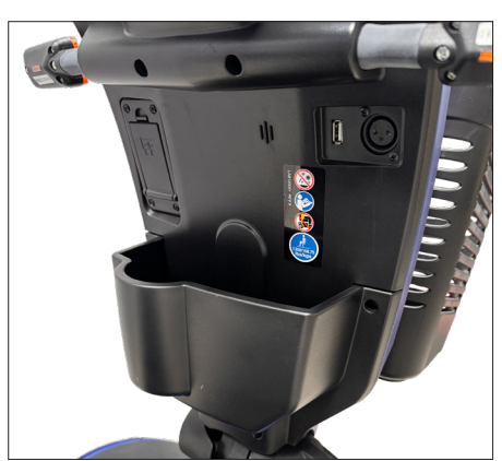
Tiller storage and USB port