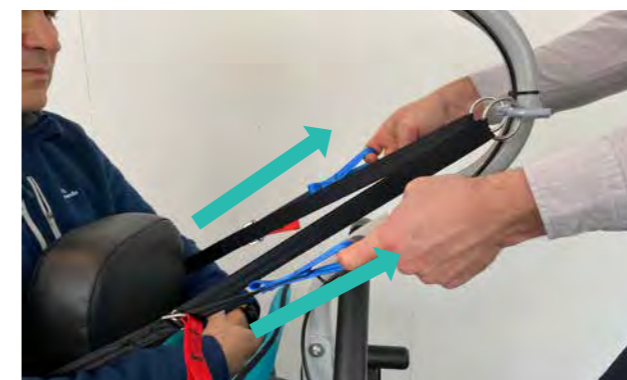
3. Pull both blue tabs at once to evenly tighten the straps

TIP: Pull the blue tabs in the same direction as the straps to make tightening as easy as possible