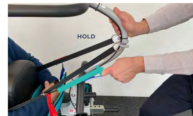
4. One at a time, pull the blue tabs using the technique shown in the photo to ensure suitable tightness (see the next section for tightening tips)

TIP: Pull the blue tabs in the same direction as the straps to make tightening as easy as possible