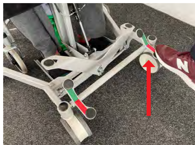
4. Apply the brake by stepping on the red Brake Pedal