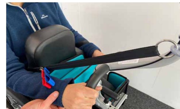
1. Help the user hold the handles or cross their arms into the cradle, by hugging the Chestpad

The Backstrap must be attached and tightened sufficiently to ensure a comfortable and secure transfer: