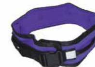
Padded Transfer Belt Various options available