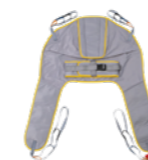
Aspire Hybrid Patient Sling Various options available