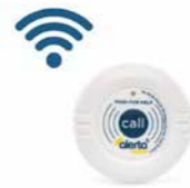
Alerta Wireless Nurse Call Button System Includes button & receiver BEA007631