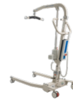
Aidacare Aspire A150F Folding Patient Lifter LSS390600 SWL 150kg