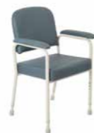
Aspire Low Back Classic Day Chair CHP208000 - Champagne Vinyl CHP208005 - Slate Vinyl SWL 160kg