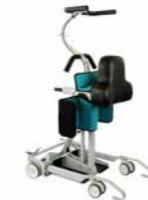
Kera Sit2Sit Standard or Low Models Multiple sizes available