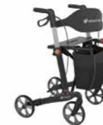
Aspire Vogue Carbon Fibre Seat Walker WAF705350 - Medium WAF705360 - Tall SWL 150kg