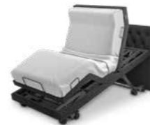
Aspire ComfiMotion Activ Care Bed Various sizes available