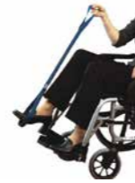
Leg Lifter DLD269390