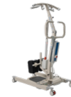
Aidacare Aspire A200S Standing Patient Lifter LSS390640 SWL 200kg