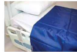
Aspire Slide Sheet TSE673070 - Small TSE673080 - Large