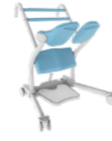
Aspire Star Patient Mover LSS390580 SWL 185kg