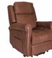
Aspire Raphael Quattro Lift Recline Chair Various size and fabric options SWL 130kg – 180kg