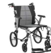
Aspire Socialite Folding Wheelchair Attendant Propelled MWS449800 - Silver MWS449810 - Red SWL 125kg