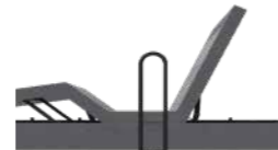
Aspire ComfiMotion - Crook Handle Bed Rail Other accessories available