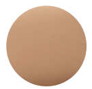
BEIGE VINYL CHP198808