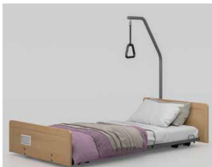
Floorline position Self help pole (accessory)