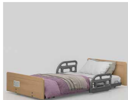
Floorline position Split folding grab rails (accessory)