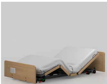
Low position, back and knee raised Sublime Teak side panels (accessory)